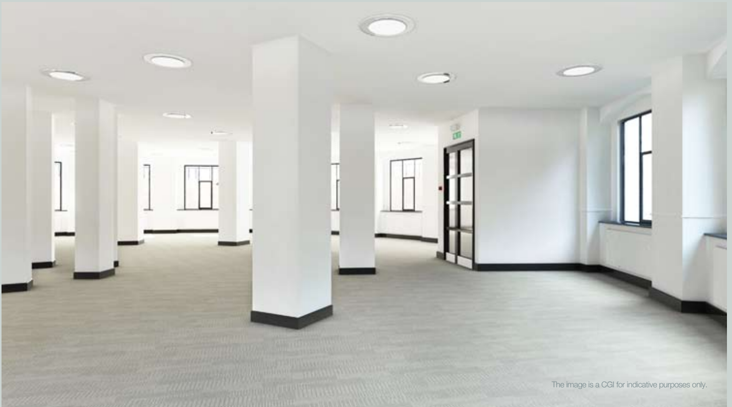
The image is a CGI for indicative purposes only.